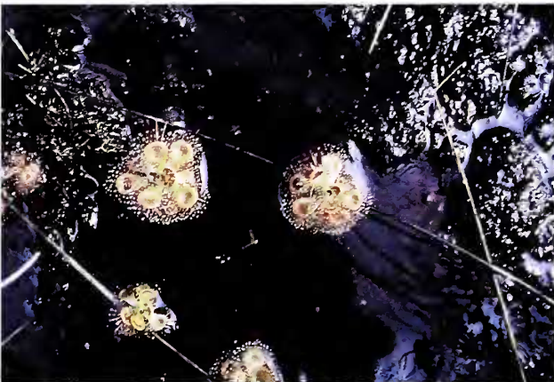
Figure 1. Drosera sessilifolia in seepage at the Chapada dos Veradeiros, Brazil.

At another site they were crowding the sides of a small rivulet cutting a grassy seepage. The other site was a seepage where they grew among large, semi-aquatic Drosera hirtella . Curiously, I only found the Utricularias that night while cleaning the Drosera for herbarium, like when I first discovered them. All of these sites seemed to be the type that are wet all year round, which indicates that U. biovularioides might be a perennial and not an annual, as Taylor suggested.